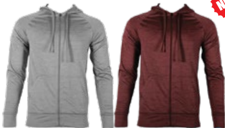
Unisex Zip Performance Hoodie (7-A)