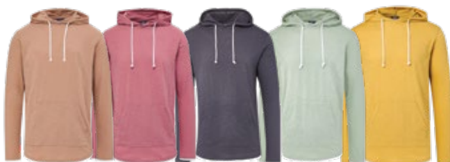
Praline Orchid Ice Iron Grey Greenstone Ginger

Available in S-XXL *XXL Sizes add $2.00/item