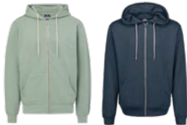
Unisex Retro Heather Zip Hood (6-C)

Look for these logos to indicate new products or additional colors for existing products!!