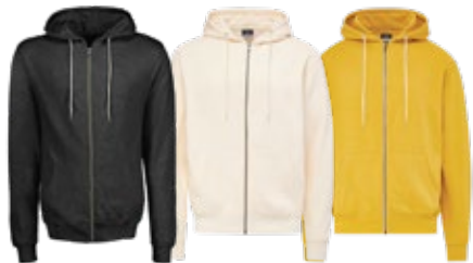
Charcoal Heather Ecru Ginger Heather