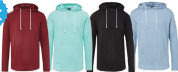
Cinnamon Oasis Black Denim Heather