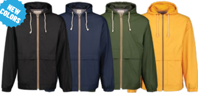
Black Navy Bronze Green Sunglow