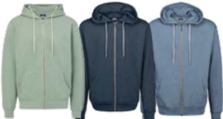
Greenstone Indigo Denim Heather