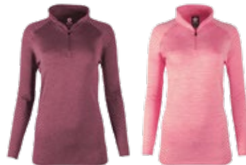
Women's Performance Q-Zip (7-B)