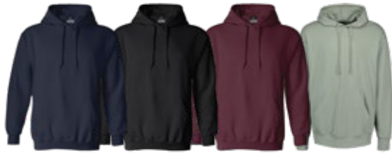
Navy Black Maroon Greenstone