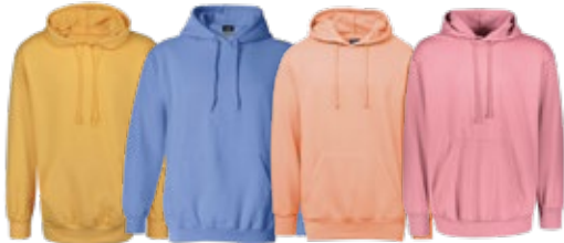
Sunglow Columbia Blue Creamsicle Orchid Ice

Perfect weight hoodie for all seasons!! Available in many colors for men and women.