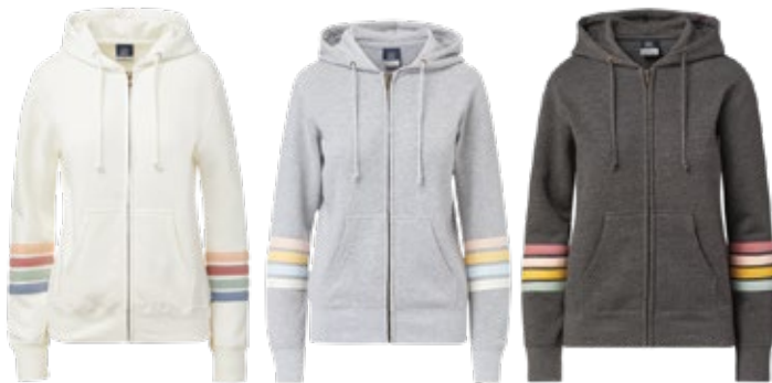
Ivory Heather Grey Charcoal

Women's full zip hoodie is stylish and comfortable and the perfect weight to wear all year round.