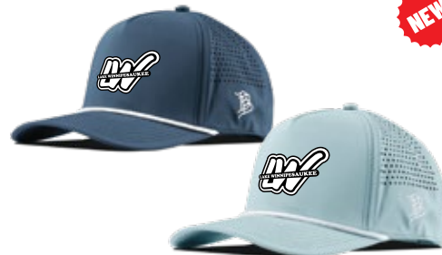
Performance Rope Trucker Hat (8-A)

The latest catalogue can be found at: https://lakekeepsakes.com/wholesale/